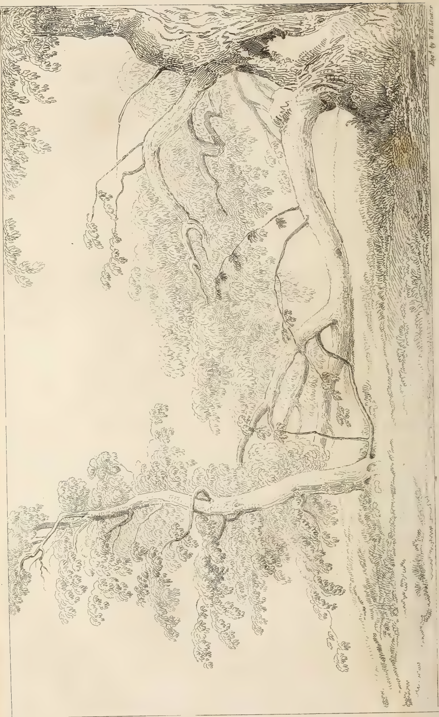
PART OF THE GREAT SPANISH CHESTNUT TREE AT RICCARTON.